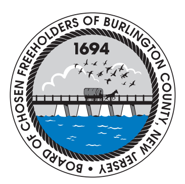
Burlington County Community Partnership for Healthy Adolescents

This Community Resource Book was prepared by the Burlington County Health Department–Community Partnership for Healthy Adolescents Program. All information is subject to change. Compiled in September 2009.