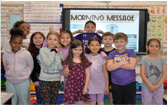
Students at Joseph S. Stackhouse Elementary School celebrate National Purple Up Day on Tuesday, April 15th.